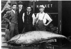
Japan Town, San Francisco, 1910