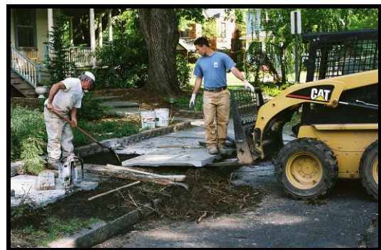
Improved Physical Conditions