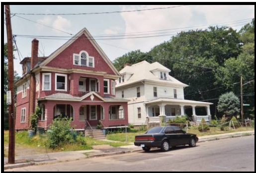
Property Maintenance – Before