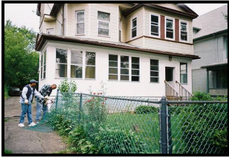
Property With Fence