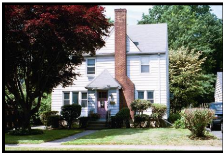
Roof – Gutters – Paint