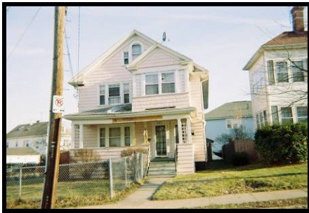
Siding – Windows – Roof & Porch