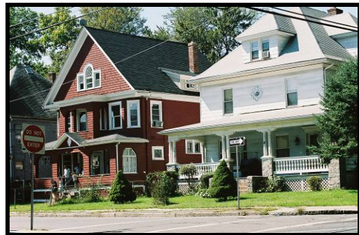
Property Maintenance – After