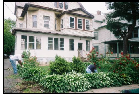
Property Without Fence