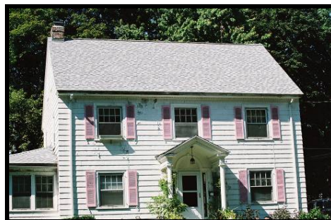
Roof – Next Paint & Windows