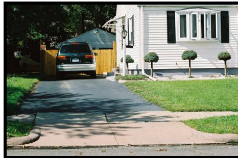
Driveway & Furnace